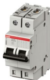
2 P 440V d.c.